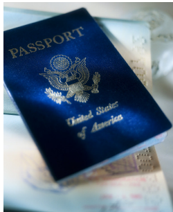
As soon as our passports have the visas stamped inside we can order our plane tickets!

One thing we do know: God has been, and will remain, in control. Just as my work permit came in His time, so, too, will the visas.